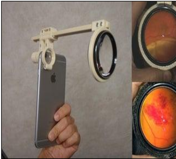
Portable Smart Phone Slit Lamp

C3 Med-Tech Smartphone based Ophthalmic Screening Devices in Partner e-clinics, Eye camps and Mobile Eye Screening settings. C3 Vision-Portable Slit Lamp and C3 Smartphone Fundus device with Volk Retina check-up lens.